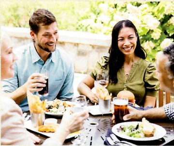
Antler Hill Village shopping and dining